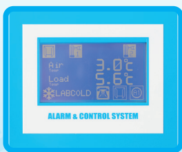
Hygienic touch screen controller

Fitted with a Dual Compressor to ensure greater temperature control and peace of mind in the event of failure of one of the systems. Each complete refrigeration system provides 100% performance, sufficient to cool down and maintain temperatures correctly without help from the second compressor.